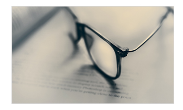
Current rules of Copyright are valid for the NFTs market