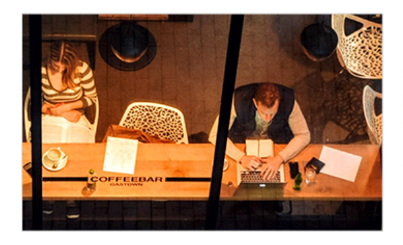
Course on Leadership and People Management for law firms