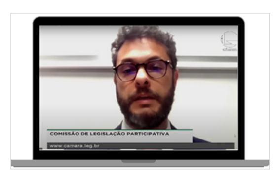
ABPI in the Participatory Legislation Commission