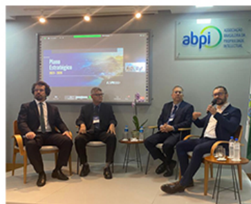
Patent examination decision in 2 years

This is one of the BPTO's goals until 2026.